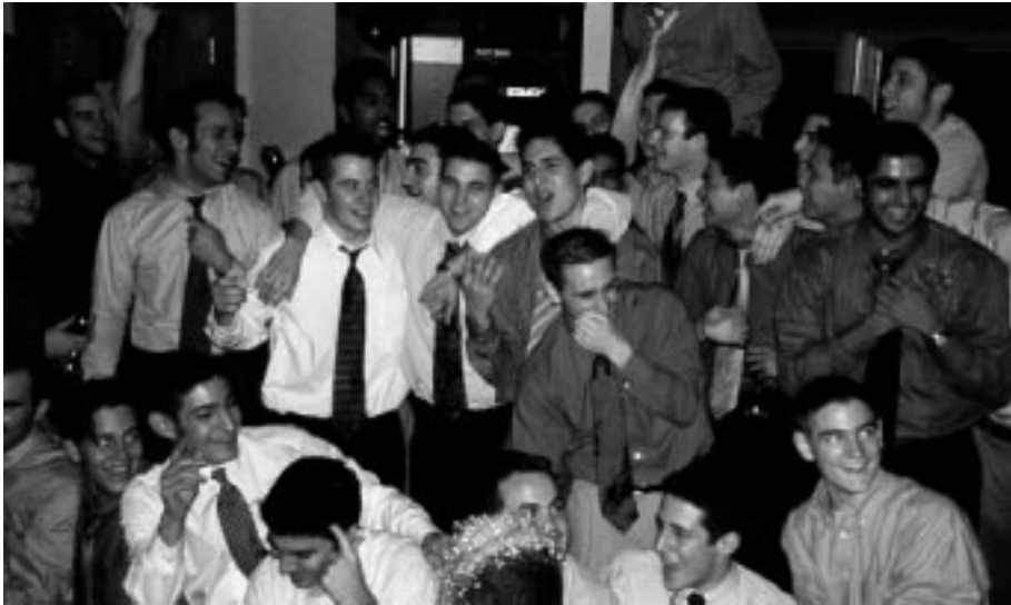
The newest members of Iota on their bid night.