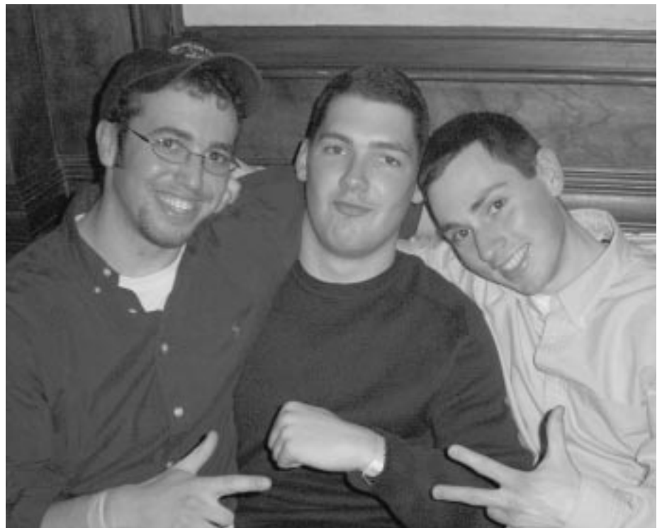
New pledges meet up with recent grads in New York City.