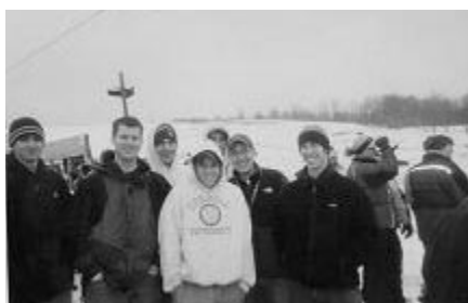
Brothers heading out to Ithaca for snowmobile expo.