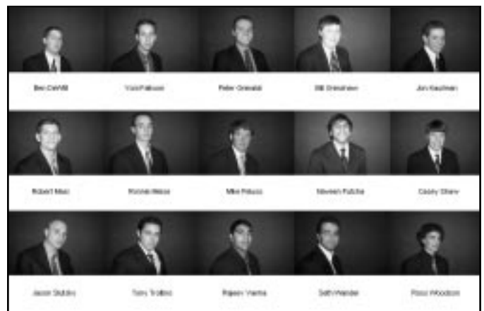
Rockledge's new pledge class, 2003