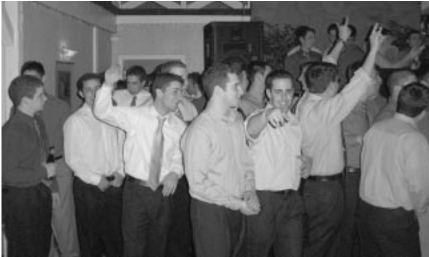
Formal: Celebrating in style.