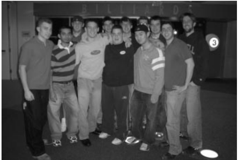
The new pledges.